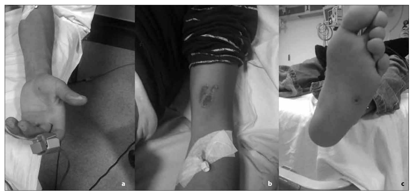
Figure 1 a-c. Burn scars of patient as an input in left arm and hand, and output in left foot

Electrical injuries can cause delayed cardiac problems. In emergency departments, such patients should have cardiac monitoring for a minimum of 24 hours, and followed by cardiologist after discharge. Also, in emergency departments, a patient who has chest pain and ECG changes should have his history investigated about previous electrical injury, so that we can differentiate myocardial infarction and other cardiac problems.